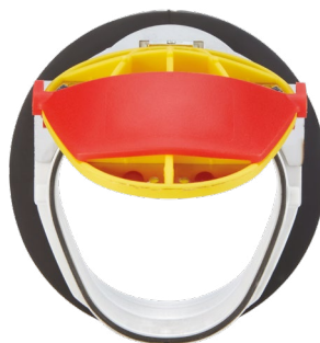
NRV100 for DN100 pipe inlets