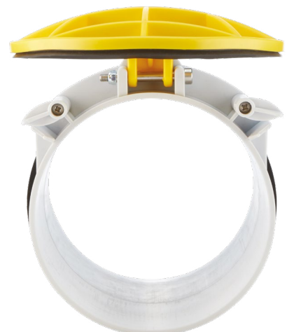
NRV150 for DN150 pipe inlets