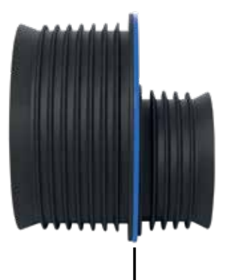
4" to 6" Adaptor (IC95-150P, IC100-150P)