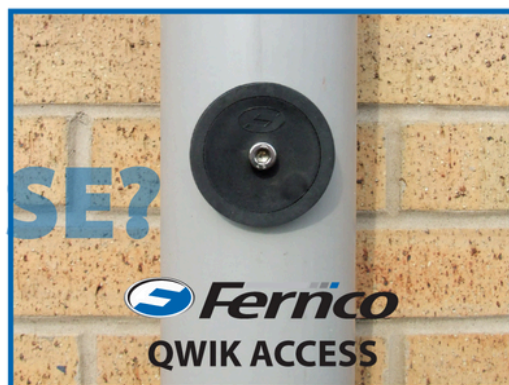
TIDY, EASY, REMOVABLE, WATERTIGHT