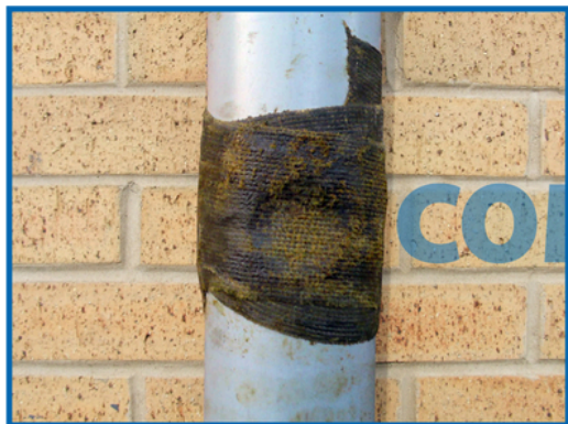
MESSY, INACCESSIBLE AND UNPROFESSIONAL